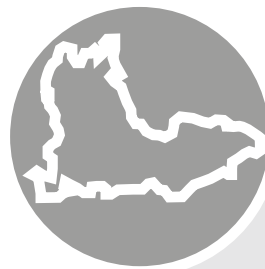
SOUTH EAST ENGLAND